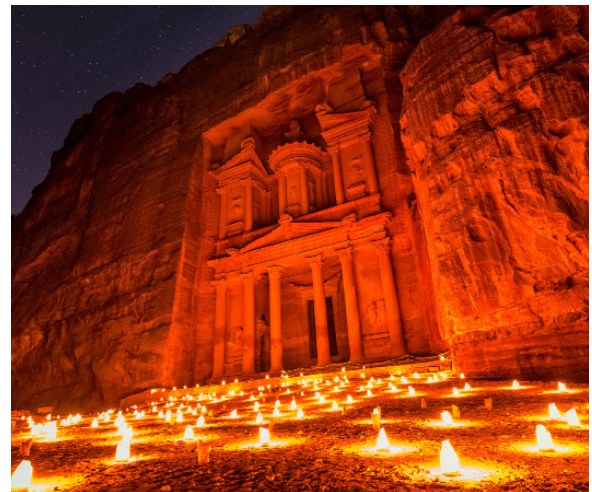
The Treasury, Petra

Overlooking Luxor temple, this winter retreat for the Egyptian royal family is the epitome of faded, luxurious glamour. Be sure to explore the extensive gardens, sip a cocktail as you watch life alongside the Nile, or take afternoon tea in one of the majestic reception rooms.