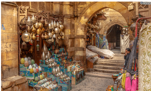
Khan el Khalili bazaar, Cairo

Visit the Roman City of Jerash and the ancient market town of Aljoun including the impressive hilltop ruins of Aljoun Castle.