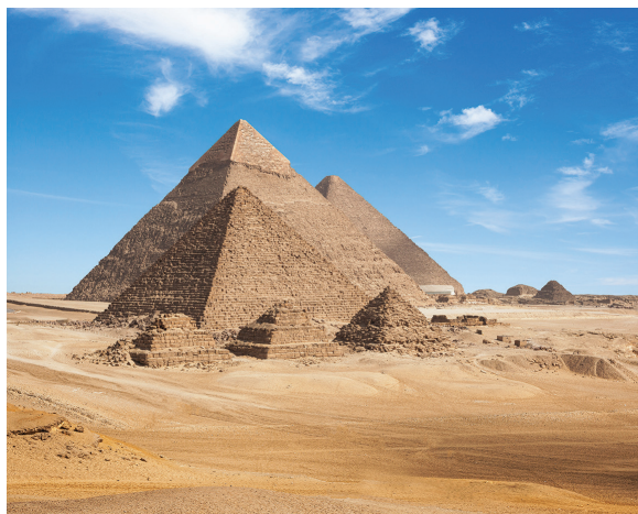
Pyramids of Giza

Start with the Egyptian Museum including the treasures of Tutankhamun before visiting the Citadel and Old Cairo. Finish the day in chaotic Khan el Khalili bazaar.