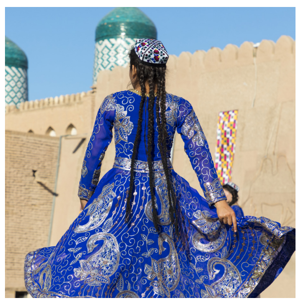
Traditional folk dancer in Khiva, Uzbekistan