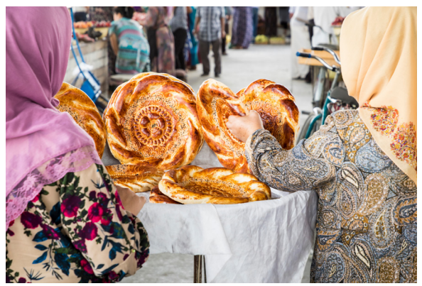
Traditional Uzbek bread

Arrangements end after this morning's breakfast when you transfer to the airport for your onward flight.