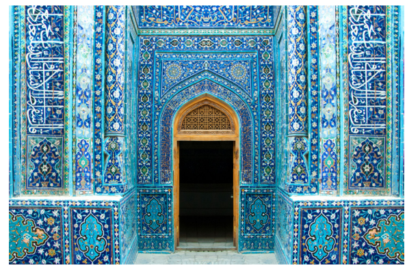
Shah-I-Zinda necropolis, Samarkand

Visit the beautiful, World Heritage fortress of Old Nisa, at the foot of the Kopet Dag Mountains, the earliest of the Parthian Empire capitals. Visit Arkadash stud farm, home of the famous Akhal-Tekke horses, one of the oldest breeds in existence. Return to Ashgabat, visit the Russian market and see the rare collection of handmade Turkmen carpets at the National Museum.