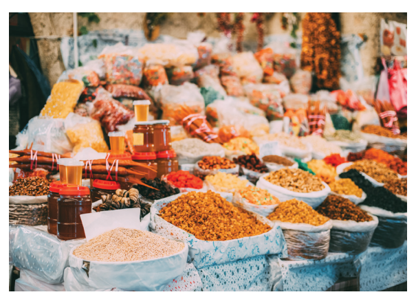
Dried fruits, Tblisi Market

making culture. Enjoy breathtaking views of the Kizikhi area and the unusual charm of Sighnaghi Royal Town. Walk the narrow streets with buildings characterised by their intricately carved wooden balconies. Lunch is a culinary masterclass and wine tasting before continuing to Tbilisi.