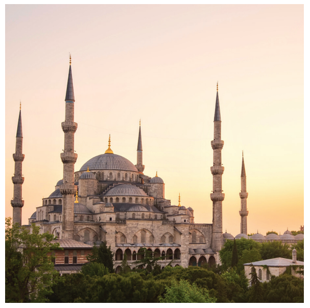
The Blue Mosque and the Hagia Sophia, Istanbul