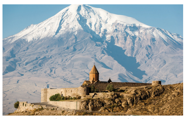
The ancient Armenian church Khor Virap

one of the most impressive natural monuments of Armenia, "Symphony of Stones", located in the Garni Gorge. Overnight in Yerevan.