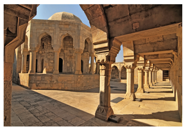
The Palace of the Shirvanshahs in the Inner City of Baku

Explore fascinating Baku today starting at Martyrs Lane for a panoramic view of the city. Then head into the Old City to see the Shirvanshah Palace, Maiden Tower, Fountain Square and Green Bazzar